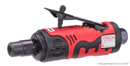
1/4" Compact Die Grinder