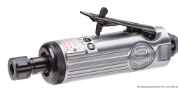
1/4" Die Grinder