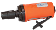
1/4" Mini Die Grinder