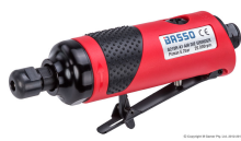
1/4" Medium Die Grinder